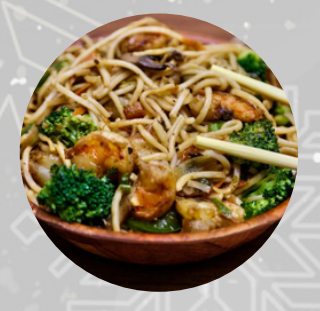
Try some Chinese food. Learn the names of the different ingredients.