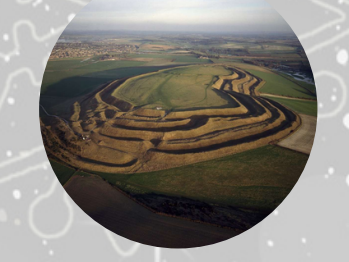
Wrap up warm and get outside. Have you visited Maiden Castle, Thorncombe Woods, Blue Bridge or Poundbury Hillfort?