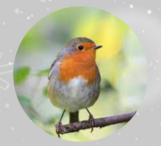
Join in the RSPB Garden Bird Watch 24-26 Jan. Pop out some food and see who comes. Details <u>here</u>