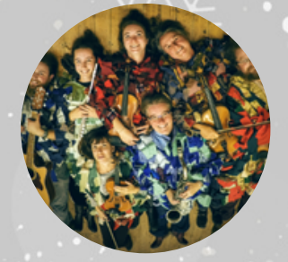
Kiddies Keilidh dance - popular last year Corn Exchange Sat 11 Jan 5.30pm £3 child. Adults free. link