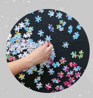
Enjoy a jigsaw puzzle together. A great activity for all the family and your child will develop their spatial awareness and maths.