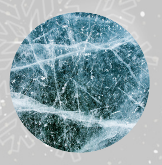
On a very cold morning safely explore the ice you find outside.

Please email any photos to foundation@damers.dorset.sch.uk by half term