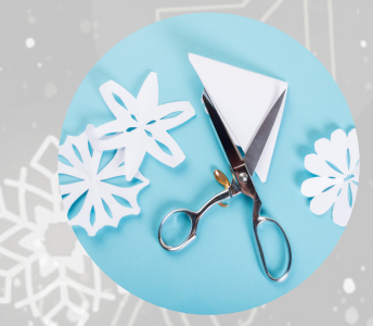
Make snowflakes and practise scissor skills!