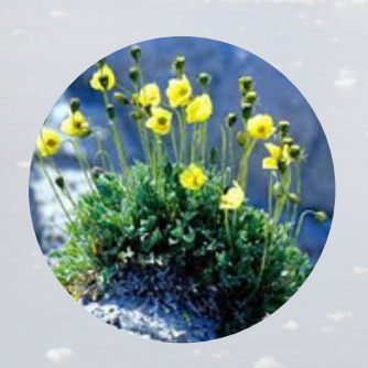
Are there any plants in the polar regions? How have they adapted to live in the cold?