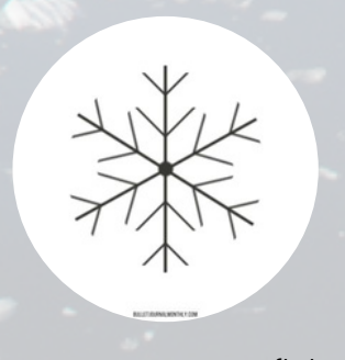
Draw some snowflakes