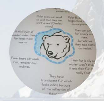
Create an "All about..." fact poster for an arctic animal.