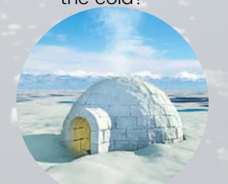
Build an igloo out of lego or sugar cubes.