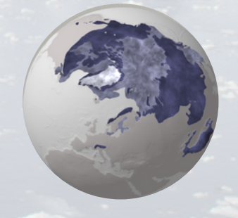
Explore how we can affect climate change in the polar regions <u>here</u>