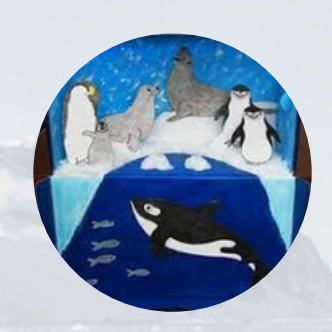
Create a habitat in a box showing the animals that live there.