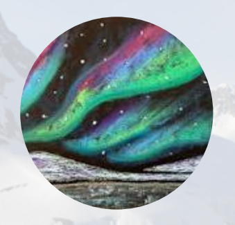
Create a 'Northern or Southern Lights' picture.

Below are some suggestions of things you could do at home. You can pick one or do as many as you like and you might have some super ideas of your own too! Any models, paintings, other work etc can be brought in for your child to share with the class. Alternatively, please email any photos to year2@damers.dorset.sch.uk.