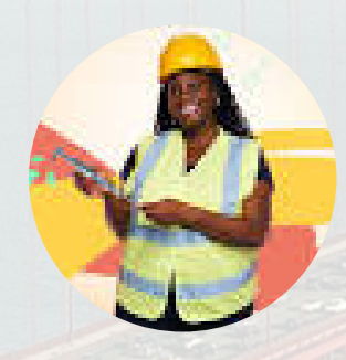
Watch <u>this episode</u> about being a civil engineer