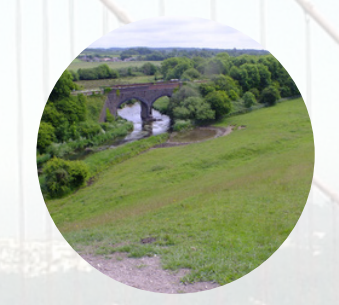
Visit or sketch a local bridge