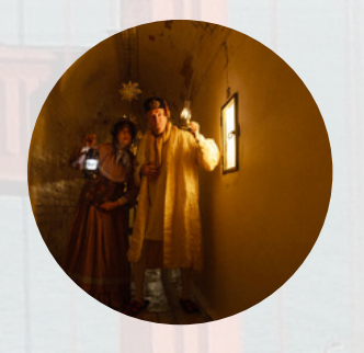
Watch a re-telling of A Christmas Carol at Nothe Forte on 14th December.