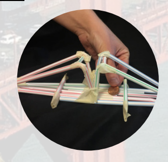
Make a bridge out of paper straws.