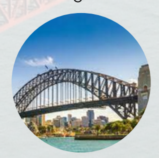
Draw some famous world bridges.