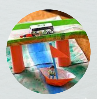
Construct a bridge out of junk modelling.