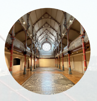
Visit the Victorian Hall in the Dorset Museum.