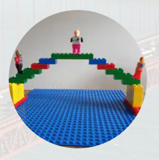
Build a bridge out of lego.